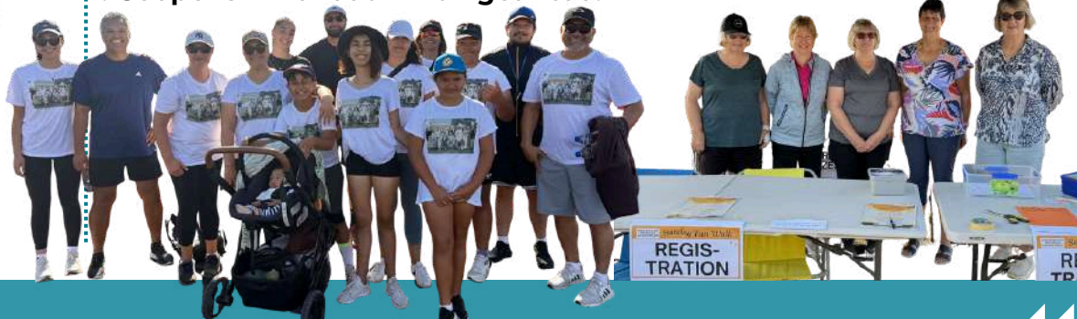
Friends of Kimihia Trust