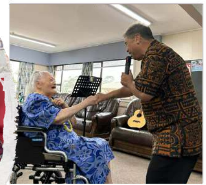
Entertainment by Leon